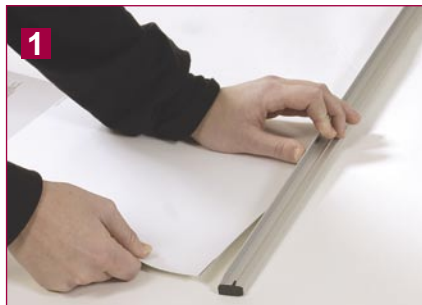
1 Open the top rail and position the graphic banner.