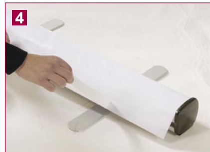
4 Remove the paper backing from the tape on the leader strip.