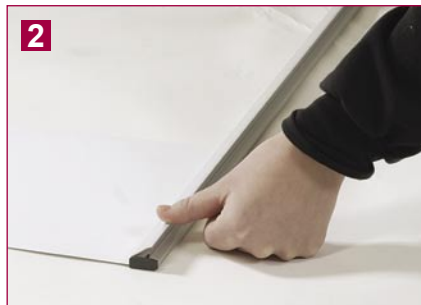
2 Lock the top rail.