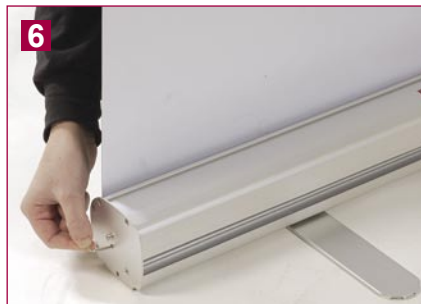
6 Hold the graphic banner firmly and remove the locking pin.