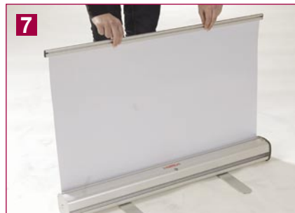
7 Let the banner slowly roll into the cassette.