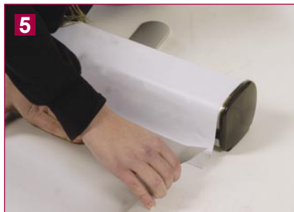
5 Attach the bottom of the graphic banner to the leader strip. Back of graphic attaches to the tape.