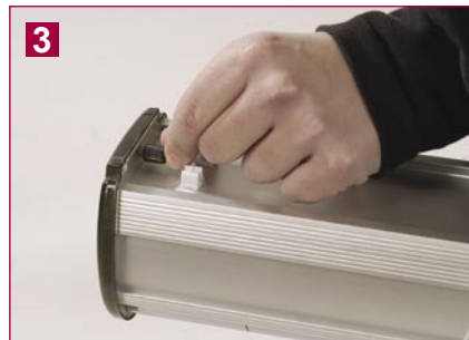
3 Remove the endcap screw (same end as the rubber pin mounts) and remove that endcap from the cassette.